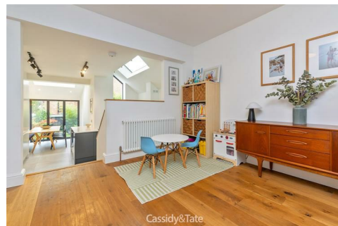
Ground Floor Approx. 524.6 sq. feet